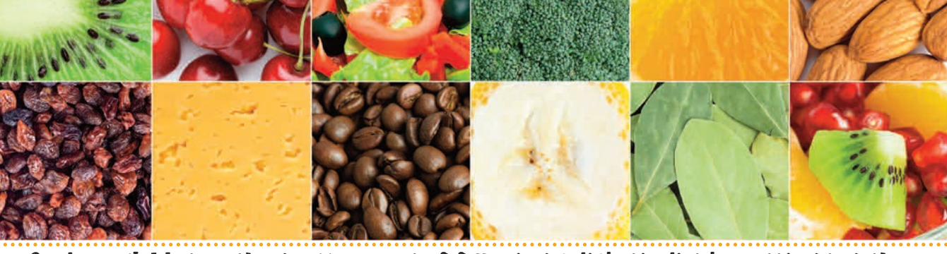
Good news! We took the guesswork out of following a diabetic diet by putting together a seven-day, 1600 calorie meal plan, including three meals plus snacks. These meals include key vitamins and minerals, avoid refined grains, and limit added sugars. Plus, recipes are included for select * items. Each meal and snack is planned to help you keep your blood sugar in check.